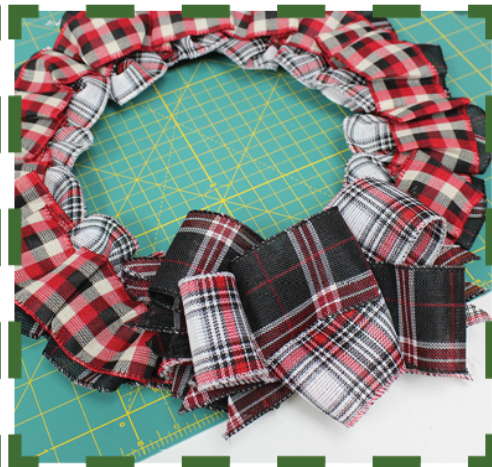
Step 7: Glue or sew the tied area to the wreath. Pull and bend ribbons to achieve desired look.