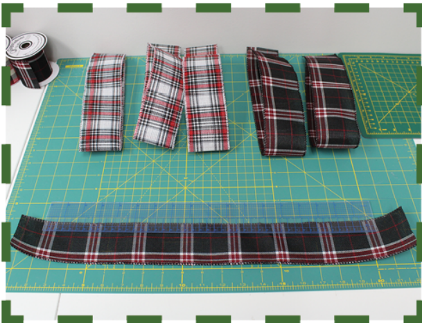
Step 5: With the remaining ribbon, cut out six 21" (53.5cm) long pieces. Fold in half and stack neatly.