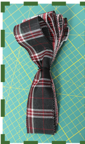
Step 6: Tie ribbons together in the middle.