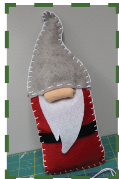
Step 10: Sew all your pieces together to create your finished gnome and attach it to the wreath.