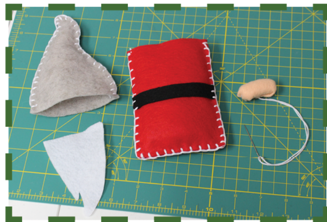
Step 9: Blanket Stitch the body pieces and hat pieces together. Stitch closed the nose piece. Stuff the body & hat with scrap felt, fabric or batting.