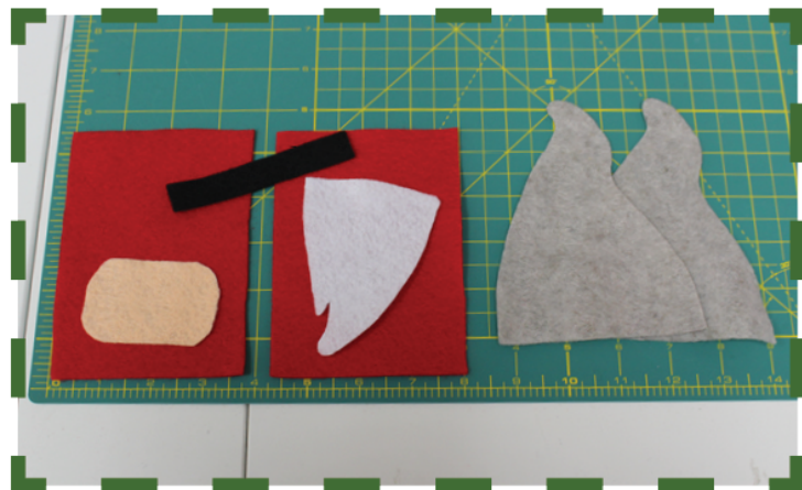
Step 8: Using lightweight felt, cut out the gnome pattern pieces.