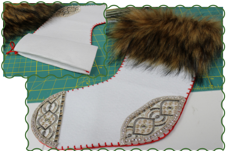
Step 4: Fold down the top of the stocking left unsewn in Step 2 & glue Faux Fur to the area to complete the stocking.