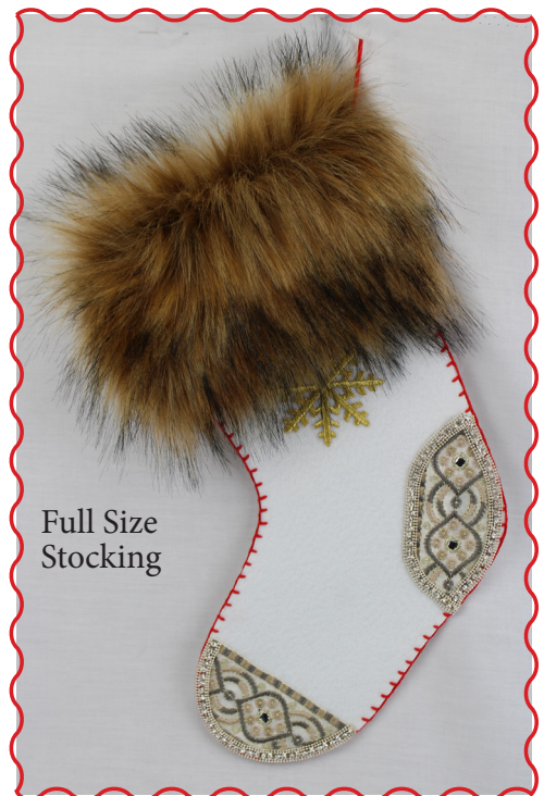
Full Size Stocking

Step 5: Add some Jingle Bells to complete your fabulous, festive ornament.