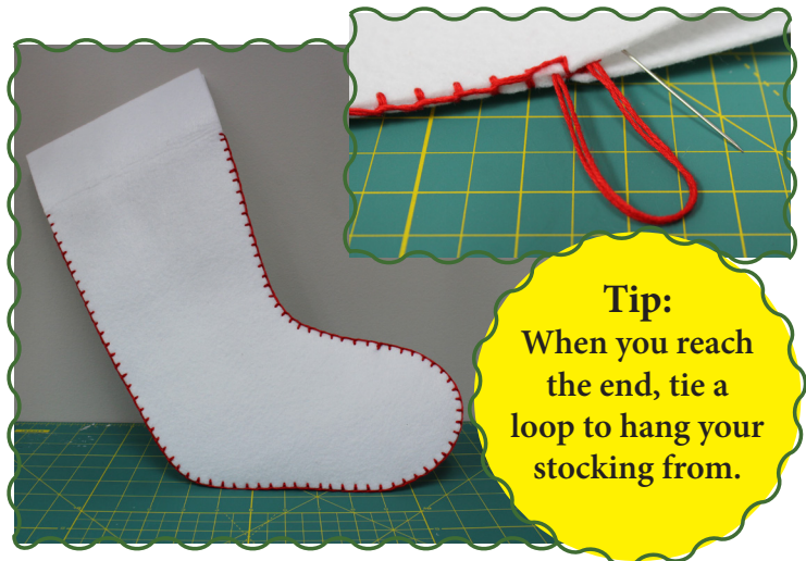
Step 2: Blanket Stitch the two pieces together, 3" (8cm) down from the top, with Embroidery Thread.