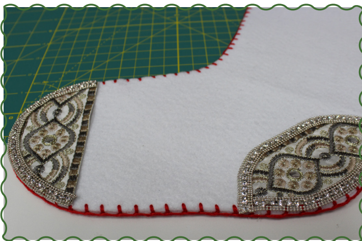
Step 3: Decorate your stocking with your favorite trim, appliques and bling! Use Glitter Glue Sticks for extra sparkle.