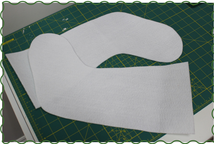
Step 1: Cut two Full Size Stockings out of Medium Weight Felt using pattern provided.