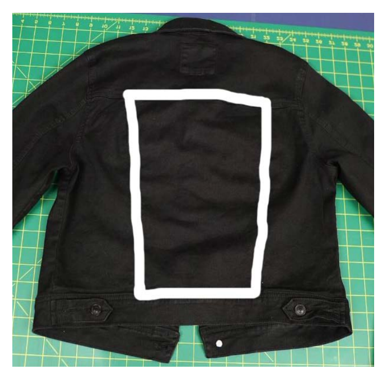
Step 2: Chalk outline for contrasting fabric

Once the contrasting fabric is positioned where you would like it to be on the jacket, trace the jacket seams onto the contrasting fabric.