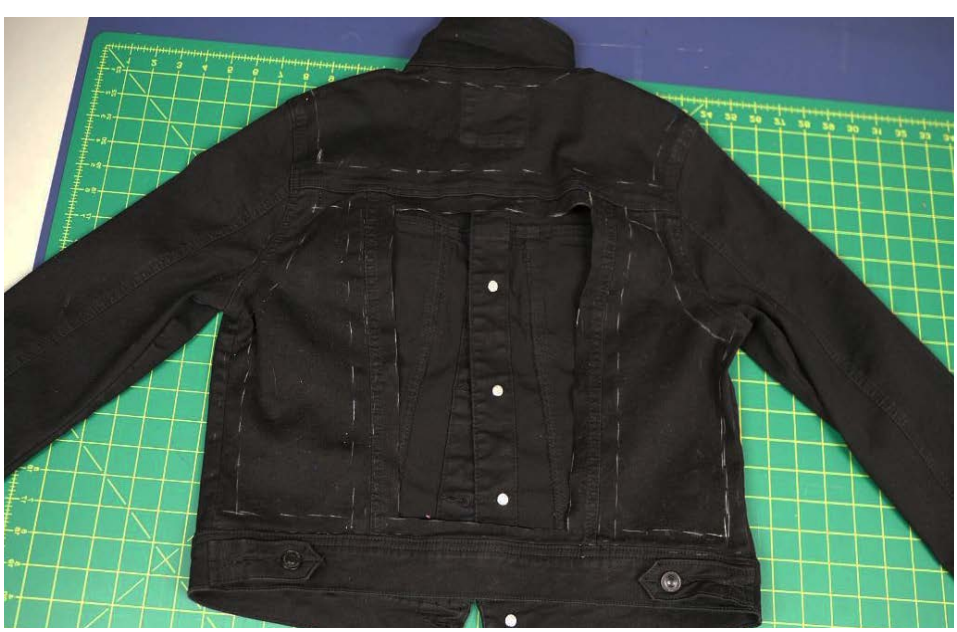
Step 4: Create the cutouts

Measure and mark ½" (2.5cm) away from the denim jacket seams inside of each panel. You will be sewing the contrasting fabric onto this extra ½" (2.5cm) seam allowance in the next steps. After marking, cut each section out along your chalk lines.