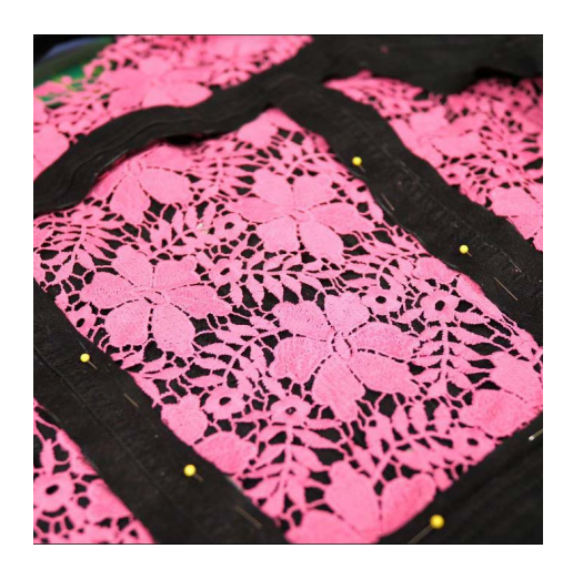
Step 5: Pin the contrasting fabric pieces inside the jacket

Place the contrasting fabric inside the cut area of the denim jacket with cut edges of the contrasting fabric visible only on the inside of the jacket. Centre and pin in place.