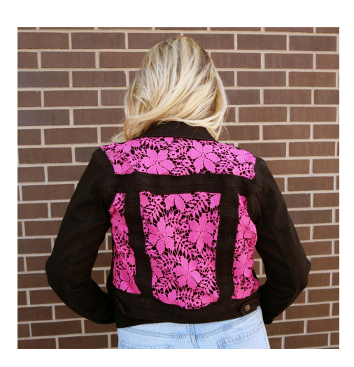
Step 1: Visualize the contrasting fabric placement

Lay the jacket flat and drape the contrasting fabric on top of the area of the denim jacket to be covered.