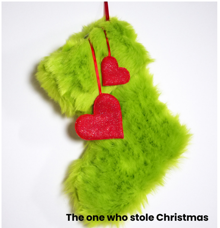
The one who stole Christmas